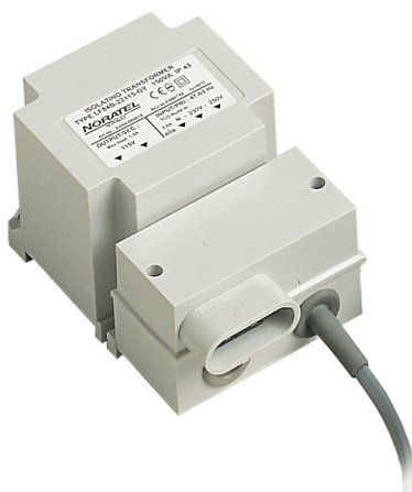
The LF-GY transformer from Noratel has a galvanic partition between the primary and secondary windings, making it what is known as an isolating/separating transformer. Transformers generate "a new system" in which any earth faults are eliminated.

The individual owner/user is responsible for reporting the fault and having it repaired by an authorised electrical contractor. There is a requirement for earth fault reporting/protection in all new installations carried out after 1st January 1991.